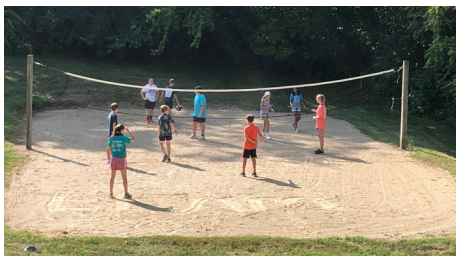
L'alto: Confirmation 7th Grade Retreat, August 2021

The word L'alto is Italian for the heights . It is based upon a famous phrase from Blessed Pier Giorgio Frassati, a lay Dominican who lived in the early 20th century. Blessed Pier Giorgio lived a life of courageous faith, seeking to go to the heights of holiness and Christian maturity. In his own words, "The higher we go, the better we shall hear the voice of Christ." We have renamed all of our junior high and high school ministries with the word L'alto in the hope that we can invite our young people to live with that same goal: a life to the full (cf. John 10:10).