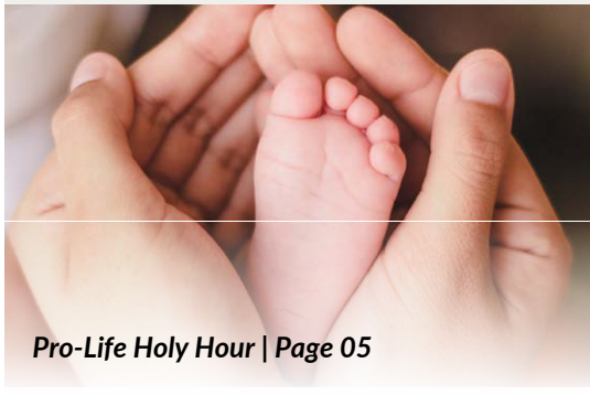
Pro-Life Holy Hour | Page 05