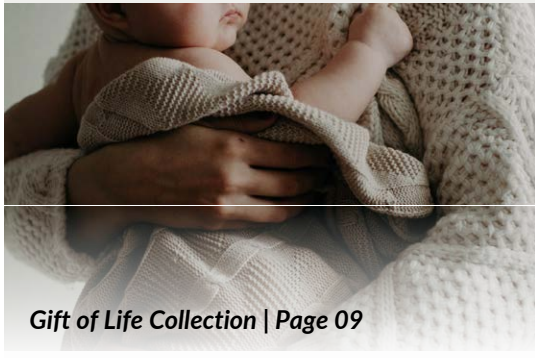
Gift of Life Collection | Page 09