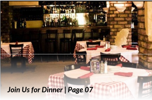
Join Us for Dinner | Page 07