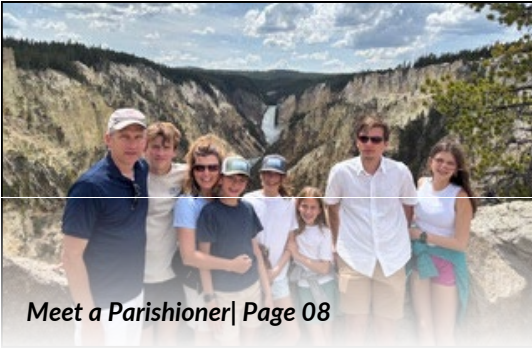
Meet a Parishioner | Page 08