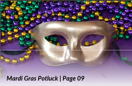
Mardi Gras Potluck | Page 09