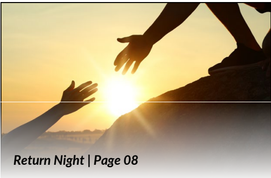
Return Night | Page 08