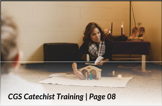
CGS Catechist Training | Page 08