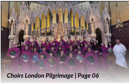
Choirs London Pilgrimage | Page 06