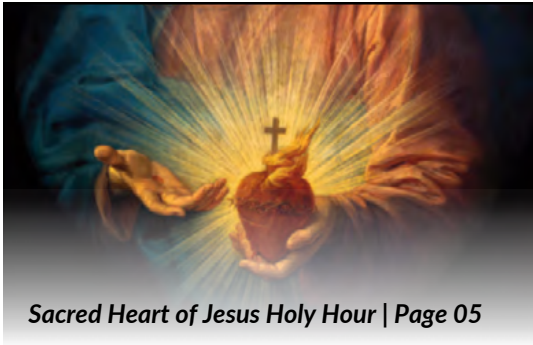
Sacred Heart of Jesus Holy Hour | Page 05