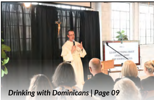
Drinking with Dominicans | Page 09